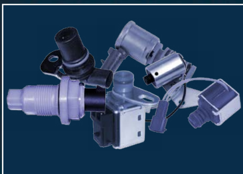
Electrical Components (for Transfer Case Units, Automatic Transmissions) (Solenoids)

Technical Application Support 1.800.921.1956, Ext 130