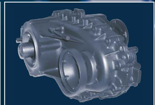
Transfer Case Units & Parts