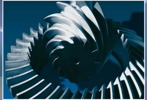
Ring & Pinions